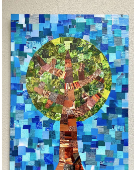
DIY MAGAZINE COLLAGE