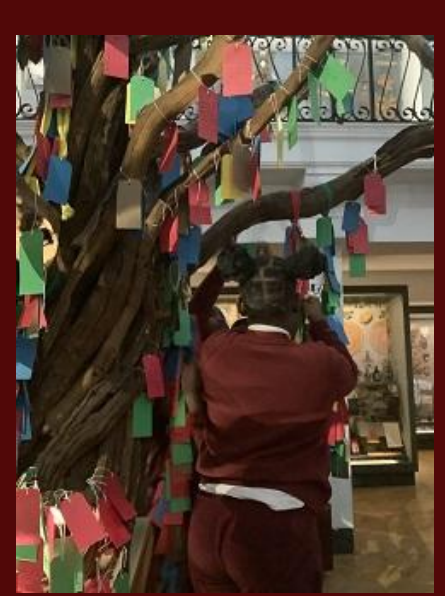
Year 5 this week visiting the Hornimans Museum