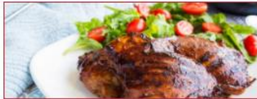
BBQ Chicken ⓘ

Please select your Main Meal choice by clicking on the image below.