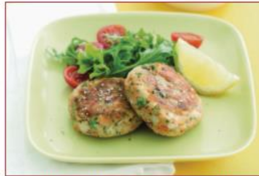
Pea, Sweet Potato & Corn Croquette ⓘ