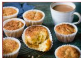
Pineapple & Coconut Muffins ⓘ

Finally select your Pudding choice by clicking on the image below.