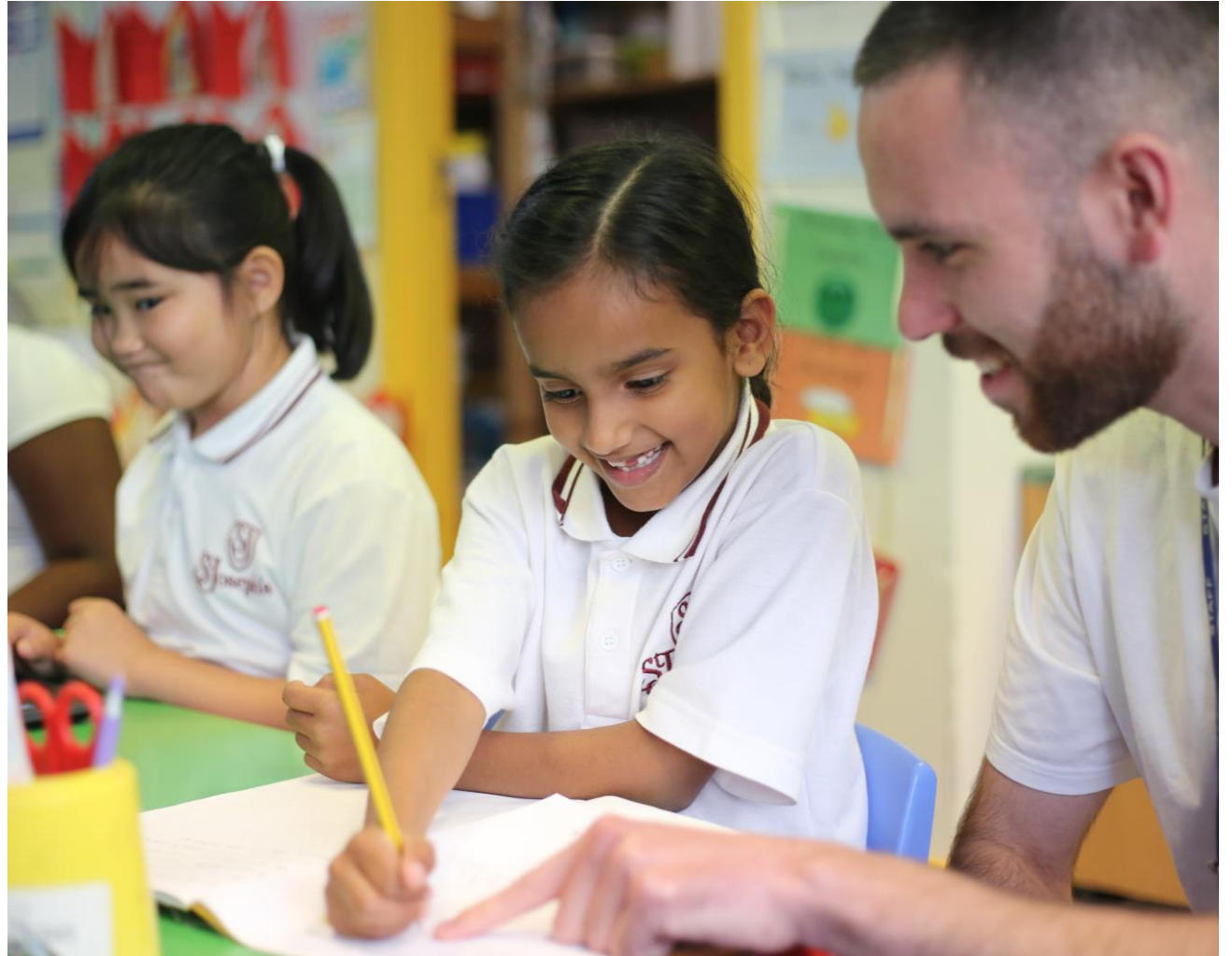
In Bold: Catholic secondary schools