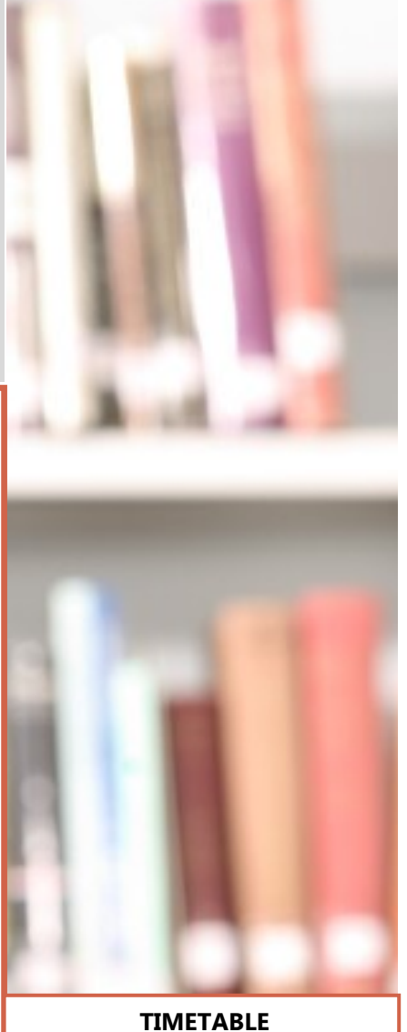
TIMETABLE P.E. is on WEDNESDAY

(Please ensure your child comes to school wearing their PE kit) HOMEWORK is due in FRIDAY SPELLING TEST is on FRIDAY MENTAL MATHS TEST is on FRIDAY